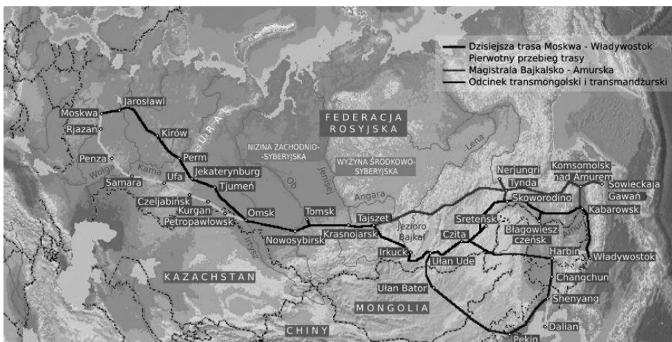
Figure 1. The route of The Trans-Siberian Railway

container (TEU) container. Much more favorable is the price of sea freight which for one TEU container varies from 1100 USD to about 1990 USD for one TEU container (Pluciński, 2013; Grzybowski, 2015). Another disadvantage of the Trans-Siberian Railway is the necessity of reloading containers and other cargo at border stations with the change of track gauge from 1524 mm to 1435 mm. The idea of using variable gauge system (for instance SUW 2000 type, developed by Ryszard Suwalski) is more applicable to passenger transport. However, the current transshipment potential of Polish and Belarusian railways on the eastern border of Poland is sufficient. Małaszewicze, Brest, Sławków and other border railway stations are fully prepared for the efficient and rapid reloading of containers for standard gauge platforms and for comprehensive cargo handling in the connections of Europe and East Asia.