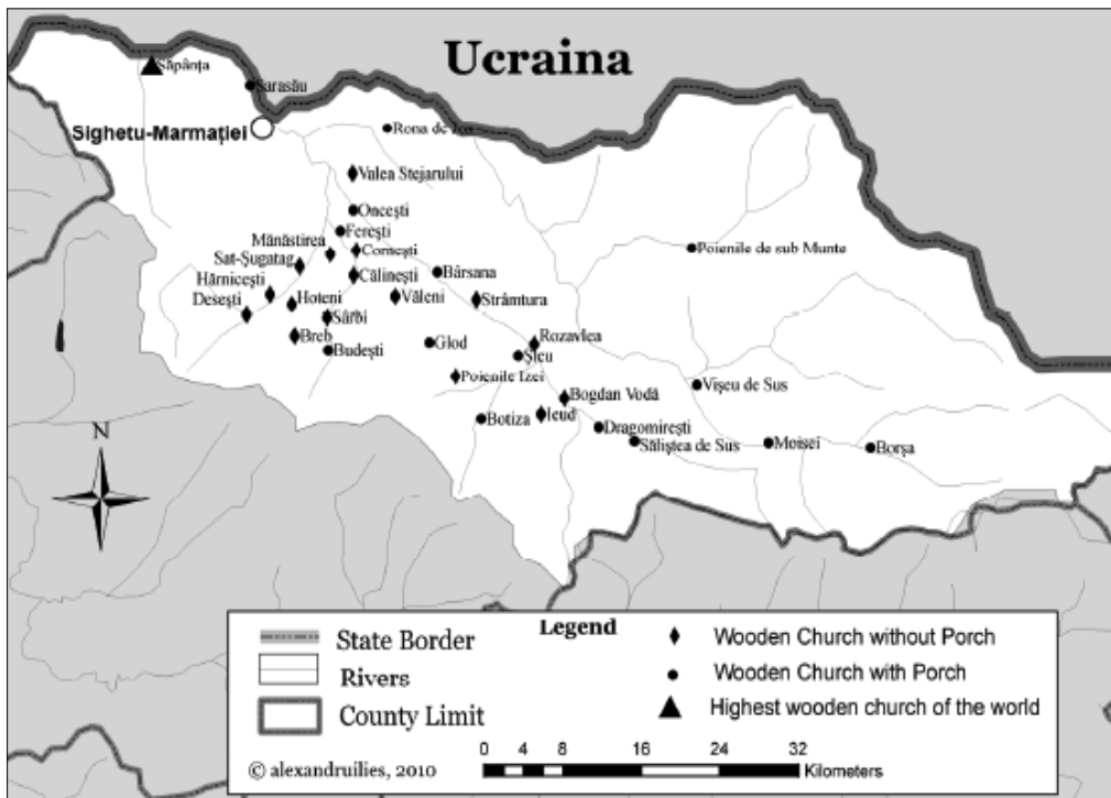
Figure 2. Wooden Churches in the Maramureș region

The traditional wooden architecture of the Orthodox churches and houses is undoubtedly the main anthropogenic value of the region (Patterson, 2001; Ștef, 2008). There are also treasures of intangible heritage. Local people are proud of their folk songs, dances and music. Almost every valley has its own unique traditional outfit which people are proud of (Ilieș, Wendt, 2015). Still, the main anthropogenic value of the regions is the wooden architecture of the Orthodox churches. The eight of them which were included on the UNESCO List of World Cultural and Natural Heritage in 1999 represents the richness of tourist values. They are usually oak or beech constructions with characteristic tall belfries and one-tier or two-tier roofs covered with shingle. They reflect all the skills and artistry of local craftsmen.