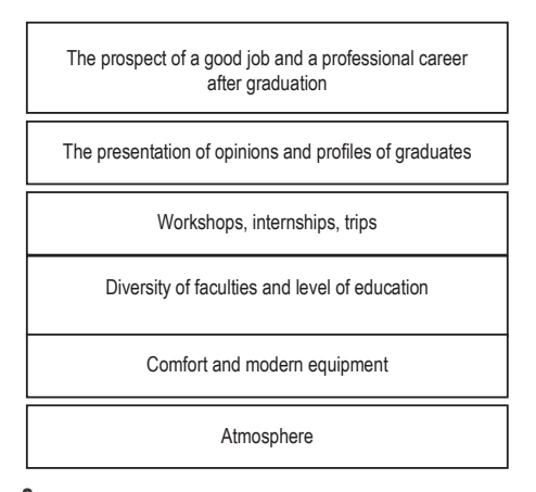
Figure 3. The most important factors when choosing a course in the opinion of the young

In the survey, potential students were asked about what should be emphasized in promotional messages. The question about this aspect was of the open type, thanks to which every subject could freely answer it. Answers have been grouped into six main areas (Figure 3), the order of which reflects their validity, i.e. the frequency of the response.