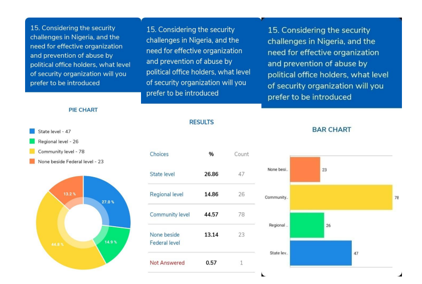
Figure 1. Preferences of the respondents concerning the level of security organization in Nigeria