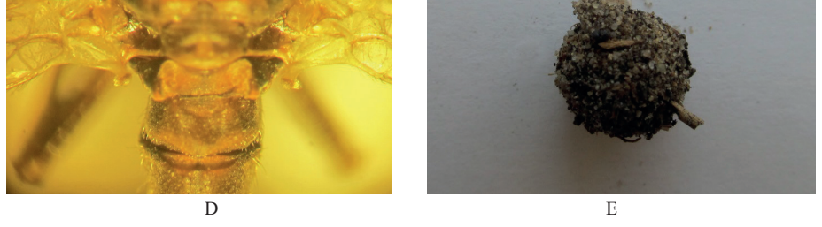
Figure 2. Euroleon nostras : A – general view, B – front view of the head, C – side view of the distal part of the male abdomen, D – axillary plates of the male, E – cocoon